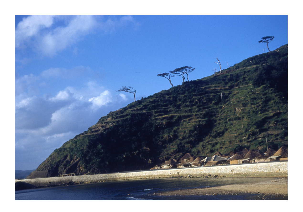
1955-57 KODACHROME SLIDE