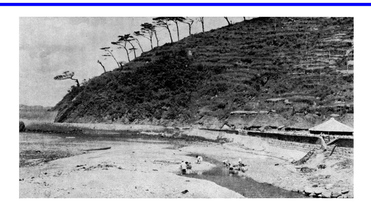
CA 1955-56 "THE U.S. AIR FORCE ON OKINAWA" PUBLISHED BY THE 313TH AIR DIVISION AT KADENA ACTUAL DATE OF PHOTOGRAPH IS UNKNOWN, BUT PREDATES THE MOSHER-REID PHOTO, BASED ON THE TREES VISIBLE