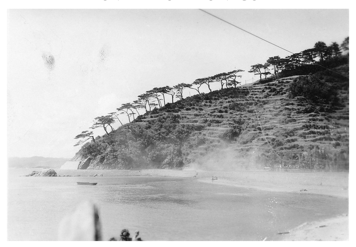
1945-46 GI PHOTO