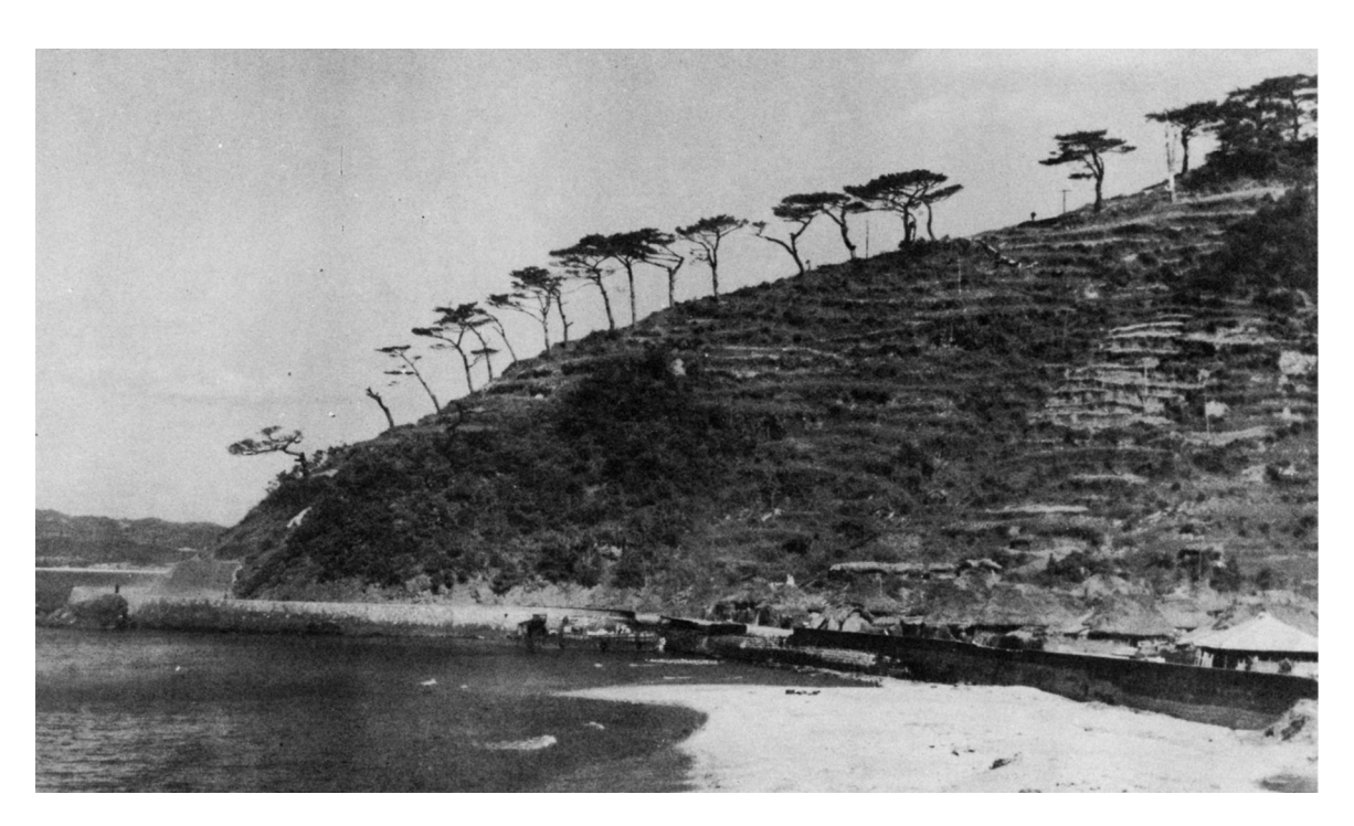
CA 1953 "PICTURES OF OKINAWA" ACTUAL DATE OF PHOTOGRAPH IS UNKNOWN, BUT PREDATES THE MOSHER-REID PHOTO BASED ON THE TREES VISIBLE