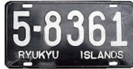
1960 - 1967, Business Vehicle