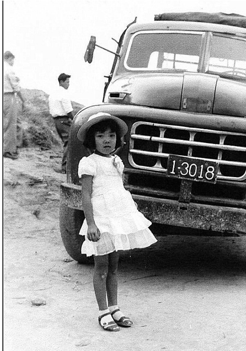
PHOTO FROM A GROUP OF PHOTOS BY AN AMERICAN SERVICE MAN ON OKINAWA IN 1954-55

THIS IS AN UNRECORDED PLATE THAT APPEARS IN 1954 DATED PHOTOGRAPHS THERE IS NOTHING ON THE PLATE TO INDICATE IT IS FROM THE RYUKYU ISLANDS. IT HAS A NUMERICAL CODE NUMBER WITH A DASH AND THEN FOUR NUMBERS.