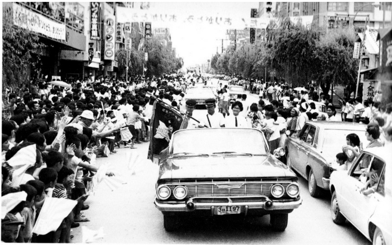
甲子園ベスト4入りした興南高校の那覇市内凱旋パレード。1968年8月31日 A victory parade to celebrate the Konan team's placement in the top 4. Aug 31, 1968