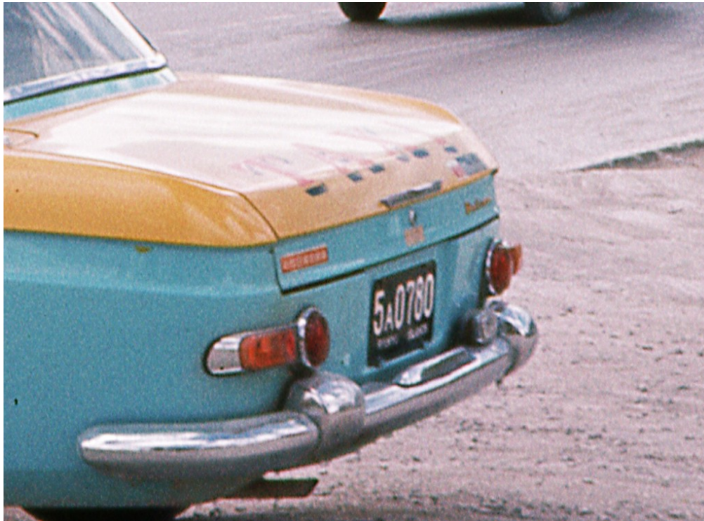
#5A - TAXI 1963-64