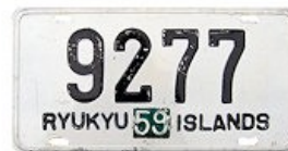
1955 - 1959, Priv. Vehicle