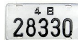
1960 - 1967, Private Vehicle