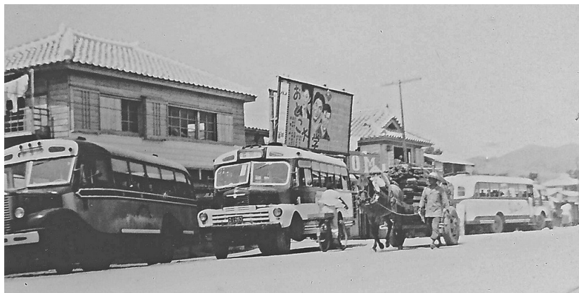
2-#### ON BUS