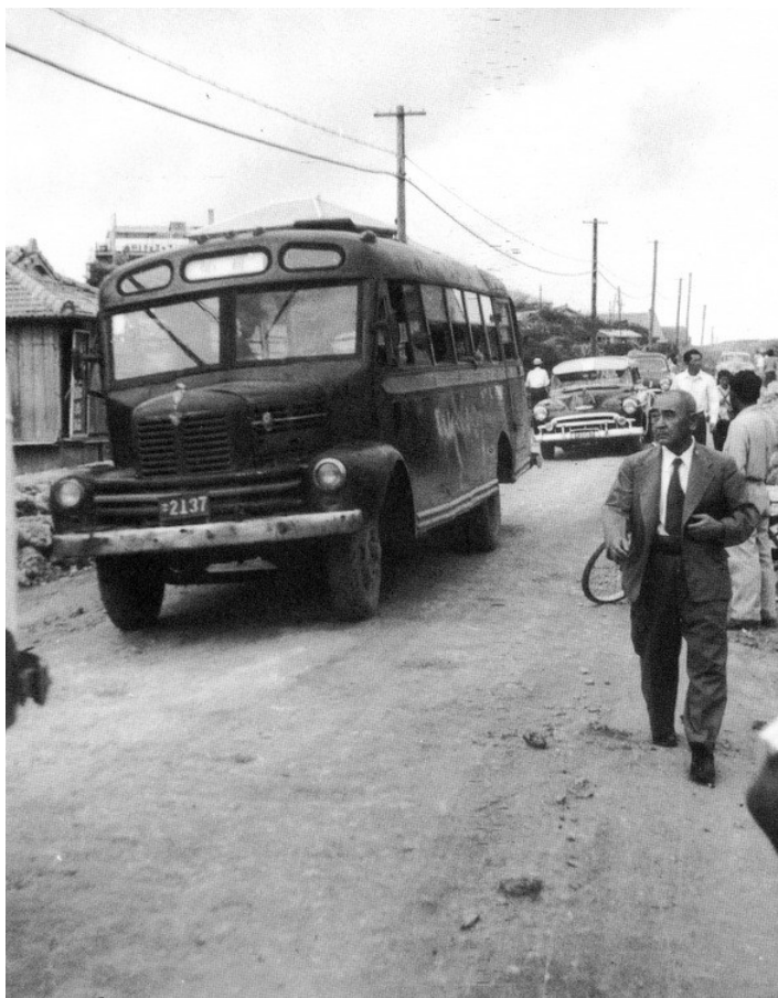
468 昭和27年12月 那覇市