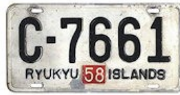
1955 - 1959, Commerical Vehicle