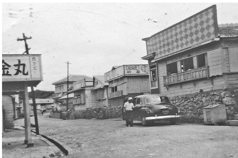
3-#### ON CAR