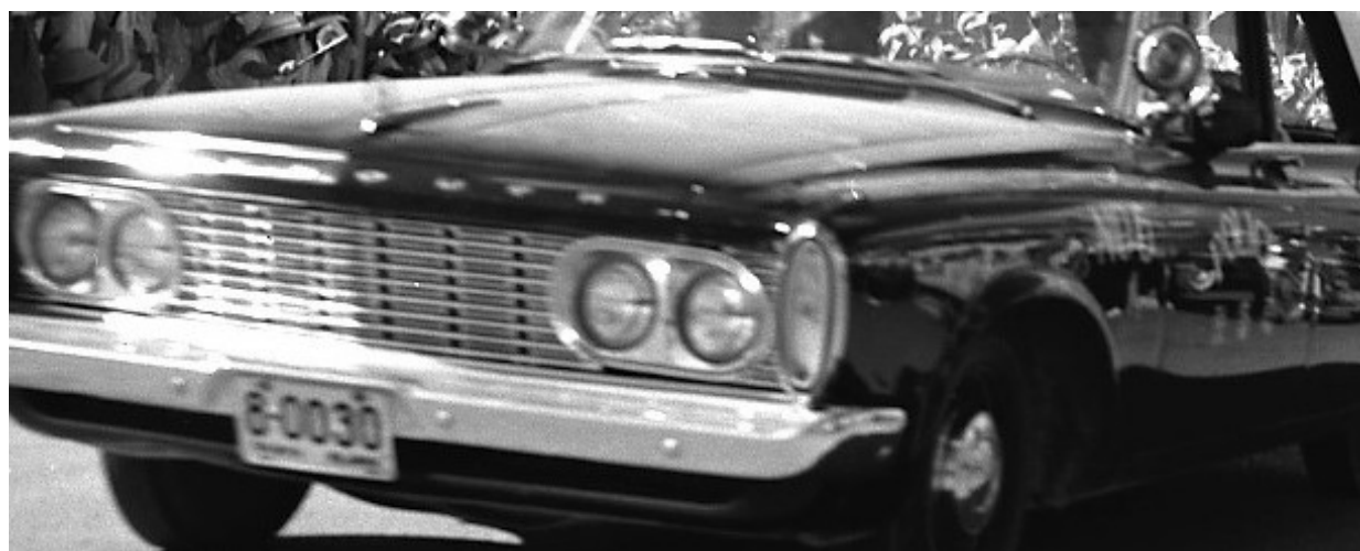
RYUKYU POLICE CAR 1964 # 8 SPECIAL USE PLATE