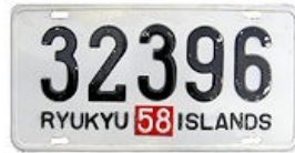
1955 - 1959, Priv. Vehicle