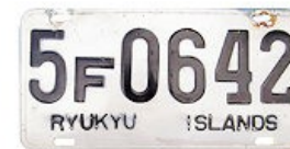
1960 - 1967, Private Vehicle